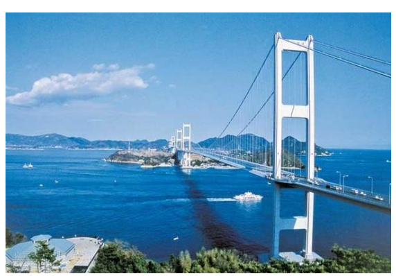
Great Bridge of Seto

To accompany the launch and development of its tourism promotion activities on the French market, Setouchi Tourism Authority (STA) has appointed the Paris-based communication agency Interface Tourism to act as its agency in France and to better introduce French travelers to the Japan Inland Sea region.